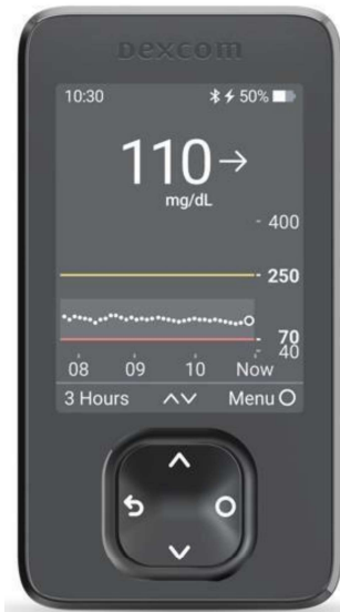
Front of Receiver Example Rendering: